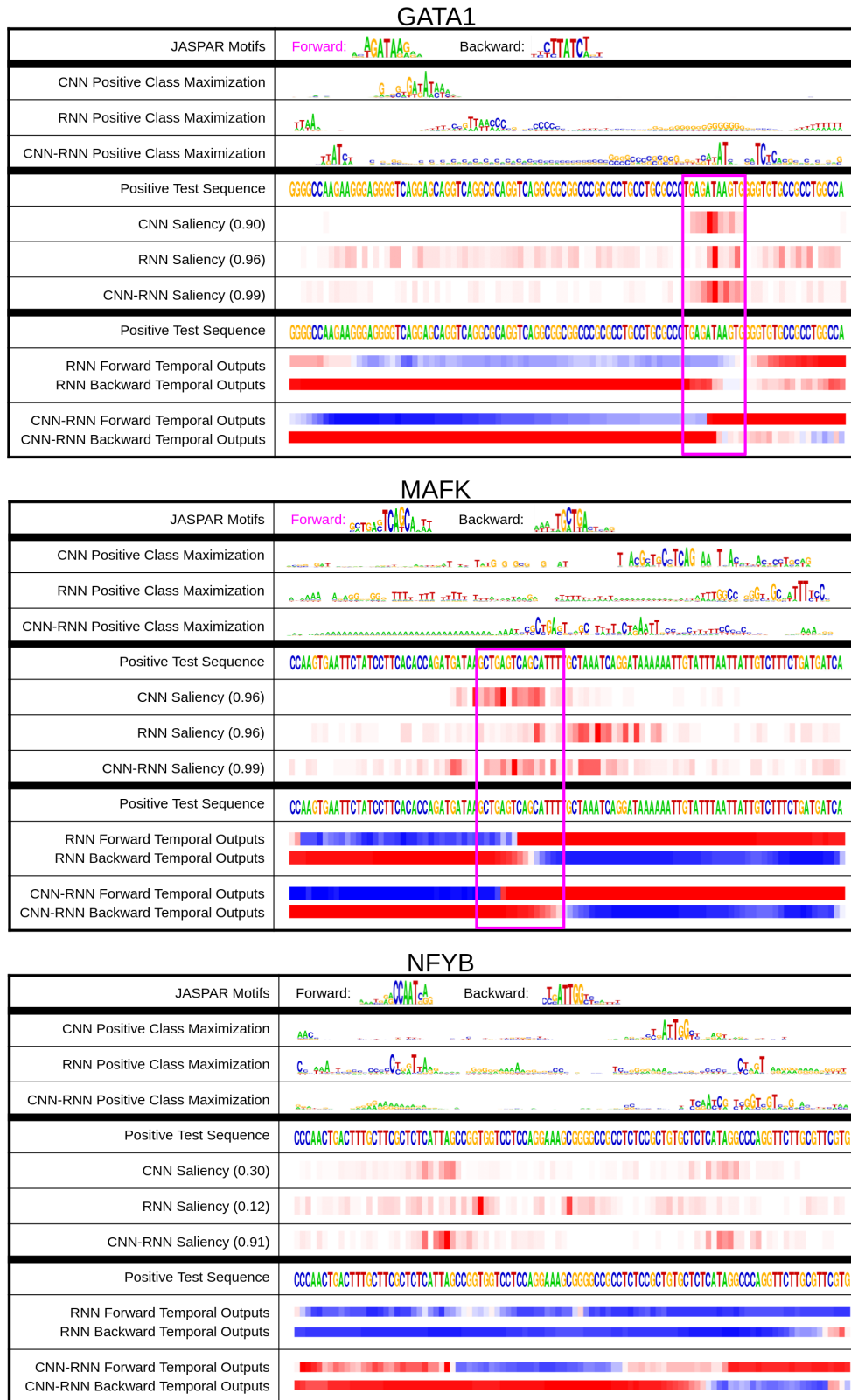
Figure 2: DeMo Dashboard . Dashboard examples for GATA1, MAFK, and NFYB positive TFBS Sequences. The top section of the dashboard contains the Class Optimization (which does not pertain to a specific test sequence, but rather the class in general). The middle section contains the Saliency Maps for a specific positive test sequence, and the bottom section contains the temporal Output Scores for the same positive test sequence used in the saliency map. The very top contains known JASPAR motifs, which are highlighted by pink boxes in the test sequences if they contain motifs.